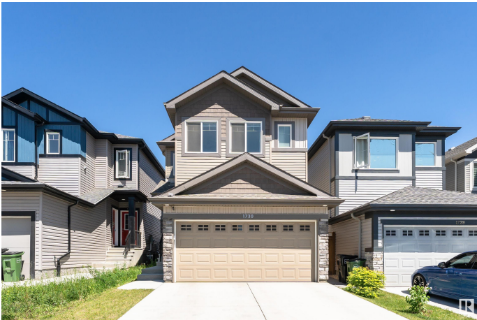
1730 Erker Way NW, Edmonton, AB

Main Floor Exterior Area 559.83 sq ft Interior Area 601.59 sq ft Excluded Area 393.83 sq ft